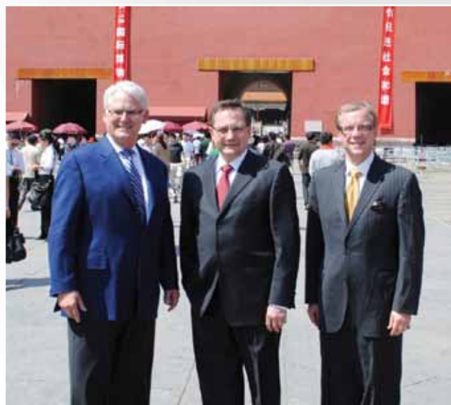
Enterprise Saskatchewan helped organize business meetings for Premier Brad Wall on his mission to China and Japan in May 2010. One of the results: a preliminary agreement with China National Petroleum Corporation, China's state-run oil company, to explore opportunities in carbon capture and storage, and enhanced oil recovery.

ES has been busy since launching in 2008. These numbers offer a glimpse into the agency's activities in fiscal 2008-09 and 2009-10.